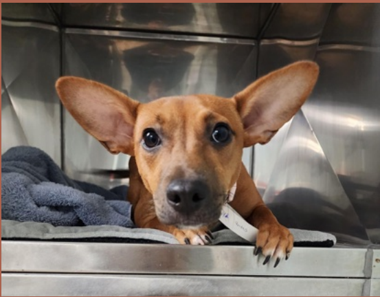
Ruby from Lexington

During November 2024, HOPE Spay Neuter Clinic will receive donations as part of Good Foods Co-op's Give Where You Live program. You do not need to be a member to shop at the Co-op's grocery, located at 455 Southland Drive in Lexington. It's easy to donate: When you check out, just round up your purchase to the next dollar or donate any amount you like. Every cent will go directly to the animals.