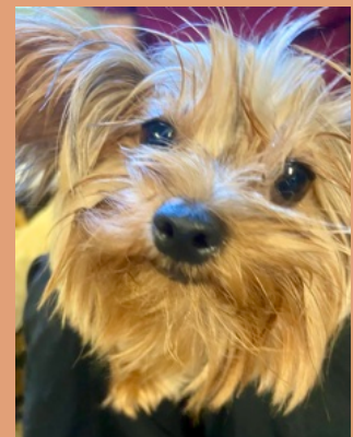
Givenchy from Nicholasville

If you would like to be part of the HOPE team, contact us at 859 873-4673 or administration@hopespayneuter.org