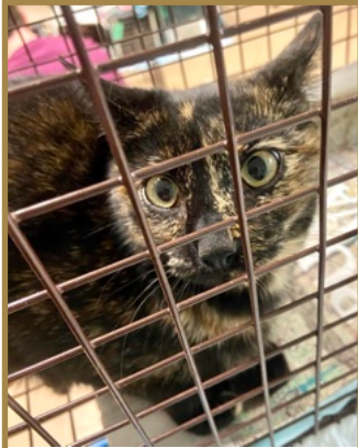
This sweet Torti was spayed at HOPE during October.

of kittens each year. Spayed/neutered cats are healthier because they no longer fight over mates or expend physical resources on making and caring for kittens. Furthermore, their nuisance behaviors are greatly reduced or eliminated.