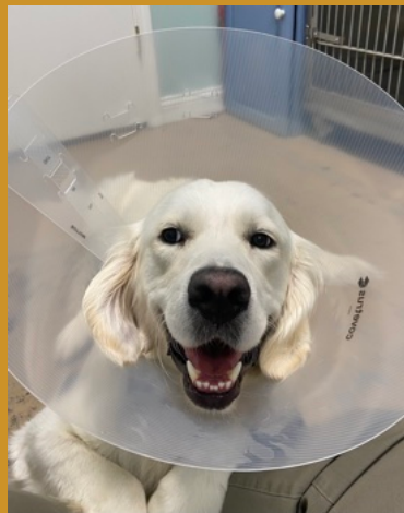
Charlie from Versailles